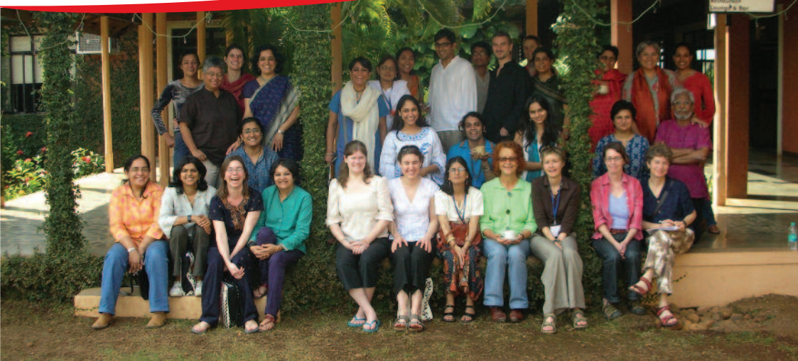
Participants at 'Agency, Sexuality and Law', a joint workshop organised with the Tata Institute for Social Sciences (Mumbai), in Goa, 11-13 December 2007.